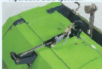
The hydraulic power package opens the gate without connecting the hose to a tractor and the finished bale rolls out.