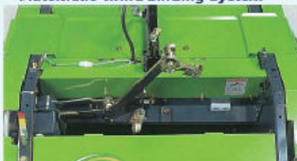
The fully automatic system sounds a buzzer and binds the bale with twine when the bale is finished. Number of binds can be set to 8 or 10 with easy adjustment.