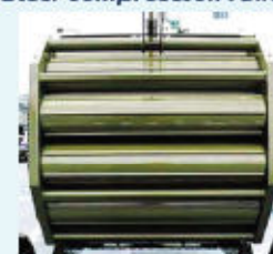
Steel compression roller makes tight tiry bales. Stable and noiseless operation. Density of bale can be set in 3 levels with pin insertion.